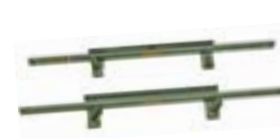
Cross Spacer with casters fitted

Part No. 091.960 provides everything you need except the Cross Spacers. Measure the width between the jacking points or other selected points on your chassis/body and select the appropriate cross spacer set from the list below. (If you have more than one car you may need more than one set)