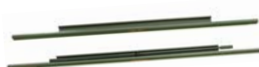
Cross Spacer 091.964 to 091.967