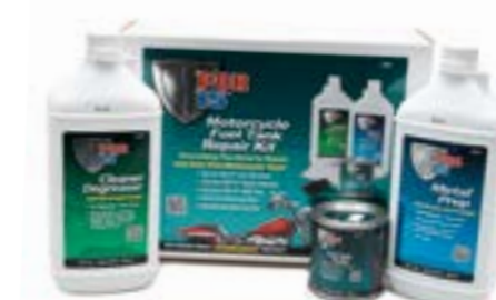
Please see our video on YouTube, more information above