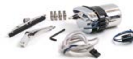
WINDSCREEN MOUNTED WIPER MOTOR A beautifully made and chrome plated quick mount wiper motor for those of you who don't want to drill your screen frame. It clamps over the top of your screen and has a quick release electrical connection for 12 volts. (If you want to put up your hood you may have to arrange it around the motor) 040.106 040.127 Spare Wiper Arm 040.128 Spare Wiper Blade