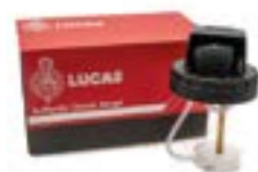
LUCAS WASHER BOTTLE LUCAS 2SJ Screen jet Electric Washer Bottle new top and pick-up only C17004LID/MO