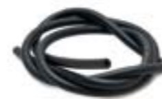
VACUUM HOSE This vacuum hose is 4.5mm internal diameter and is ideal for connecting Trico vacuum operated washer bottles to the inlet manifold. Blue/black 030.018