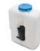
WASHER BOTTLE Incorporating a 12V electric pump built in to the side of the plastic bottle. With bracket. Capacity 1.2 litres. Use 4mm washer tubing. 145mm x 70mm x 180mm 040.049