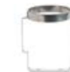
WASHER BOTTLE BRACKET For Small Tudor Washer Bottle 040.010 Stainless steel 040.067