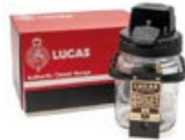
LUCAS 2SJ WASHER BOTTLE 12 volt electric operation. As fitted to Jaguar 'E' Type series I, Aston Martins in 1960s etc. 2SJ