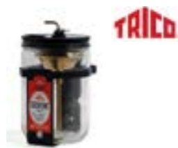
TRICO WASHER BOTTLE Vacuum operated. As fitted to Jaguar XK150 , many other 1950s applications. 125mm x 145mm x 215mm 040.009