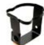
WASHER BOTTLE BRACKET XK120 windscreen washer bottle bracket 040.069