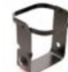
WASHER BOTTLE BRACKET Suitable For Mk I / Mk 1 3.4 Mk IX / Mk 9 Mk VII / Mk 7 XK 120 DHC XK 120 FHC XK 120 OTS XK 140 DHC XK 140 OTS XK 150 DHC XK 150 FHC XK 150 OTS XK 150 S DHC XK 150 S FHC XK 150 S OTS Measurements depth: 14cm height: 15cm width: 13cm 040.072