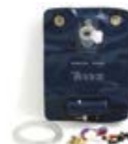
BAG TYPE WASHER BOTTLE Incorporating a 12V electric pump built in to the side. Width approx 210mm x 290mm tall. With 4mm tubing and a bracket to hang it on 040.050