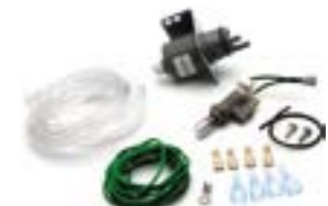
VACUUM CONTROL BUTTON - ELECTRONIC CONVERSION Trico windscreen washer control button, chrome. Electronic conversion. Replacement for Jaguar C5472/7 040.719