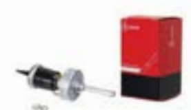
LUCAS 145SA LUCAS 145SA wiper switch with built in manual washer pump 155495-L