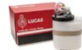
LUCAS WASHER BOTTLE Electric operation. As fitted to Morgan , many other 1960s & 1970s applications WSB101