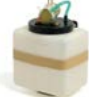
LUCAS WASHER BOTTLE 12V electric operation. As fitted to Triumph TR6 140mm x 120mm x 210mm 518264