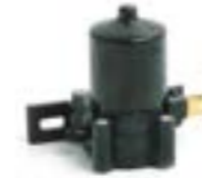
WASHER PUMP Universal 12 volt. Flange mounted 040.015