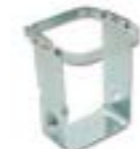
WASHER BOTTLE BRACKET Suitable For Mk I / Mk 1 3.4, Mk IX / Mk 9, Mk VII / Mk 7, XK 120 DHC, XK 120 FHC, XK 120 OTS, XK 140 DHC, XK 140 OTS, XK 150 DHC, XK 150 FHC, XK 150 OTS, XK 150 S DHC, XK 150 S FHC, XK 150 S OTS depth: 14cm, height: 15cm, width: 13cm 040.071