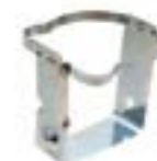
WASHER BOTTLE BRACKET XK120 windscreen washer bottle bracket 040.070