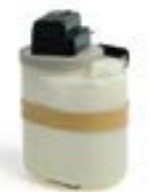
LUCAS WASHER BOTTLE 12V electric operation. As fitted to Jaguar E Type series I 4.2, series II etc. 130mm x 100mm x 190mm 5SJ