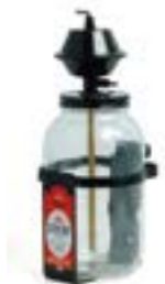
TRICO WASHER BOTTLE Vacuum operated. As fitted to Jaguar XK120, 140 & Rolls-Royce 040.000