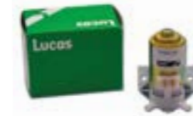
WASHER PUMP 12volt with metal casing 040.039